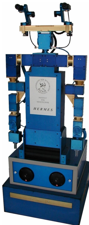
Figure 1: Humanoid experimental robot HERMES with an omnidirectional undercarriage, a bendable body, two arms with two-finger-grippers and a 6-DOF stereo vision system; size: 1.85 m x 0.70 m x 0.70 m; weight: 250 kg, low center of gravity provides good stability

We believe that future robotic systems could benefit from applying these design strategies and guidelines in addition to general design rules that must be followed by the designer of any robotic system with respect to the application domain. In the sequel these design strategies are explained in greater detail.